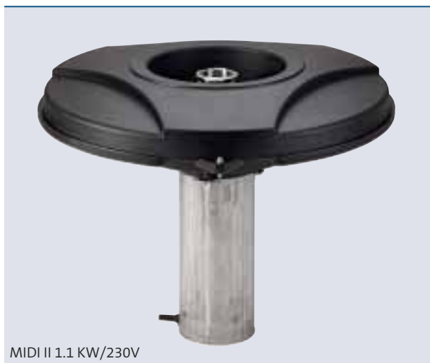
MIDI II 1.1 kW/230V