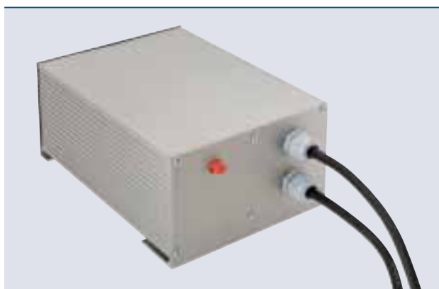
Schuko plugs + control box The 230V version is delivered ready for operation with control box and Schuko connector.

Three different motor power outputs with confirming to standards earthed plugs (230 V) and motor circuit breaker or CEE plug (400 V) offer solutions for different bodies of water and conditions. Optimised water pressure creates impressive heights for the four available nozzle patterns with 3" standard threads for fast changing. The easy-to-install LunAqua 10 LED/01 illumination set provides for impressive illumination of the water features with a height of up to 16.5 m.