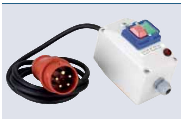
CEE-connector + protection switch The 400V version comes with a ready-to-connect, 5-pole CEE connector and motor protection switch